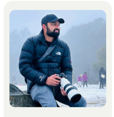
Yadav Dhirendra Photography/Videography Creative